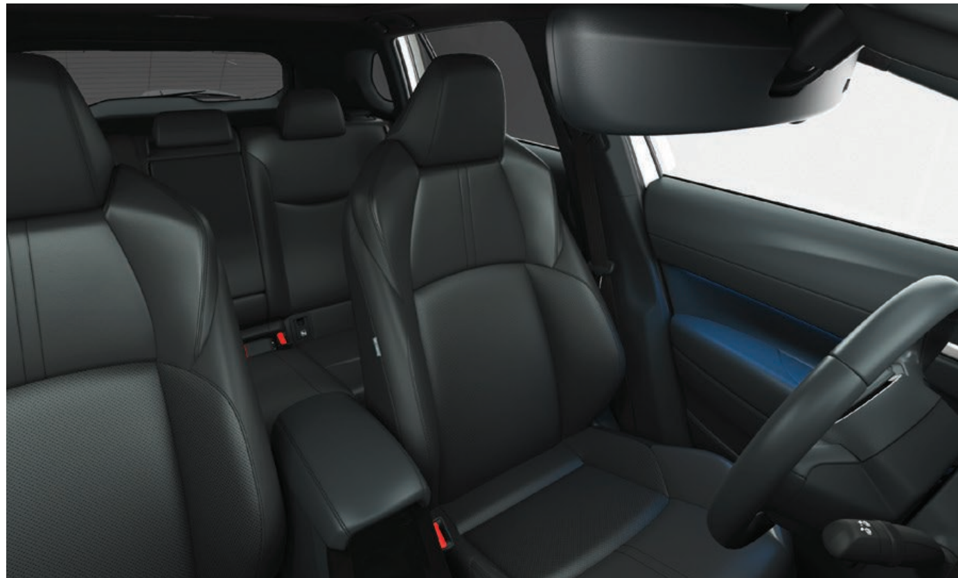
Black Fabric Upholstery (Luna & Sport) Black Partial Synthetic Leather Upholstery (Sol)