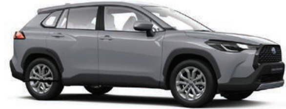
Manhattan Grey (1H5)