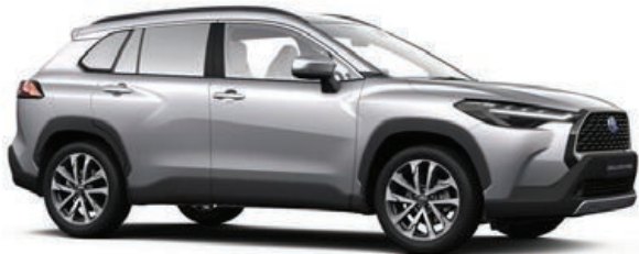
Atomic Silver (1L0)