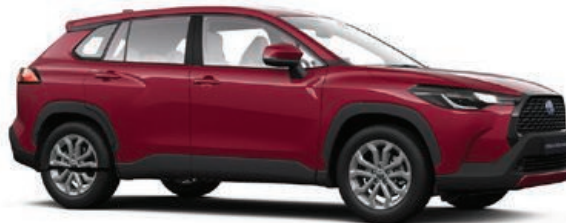
Tokyo Red (3T3) Pearlescent