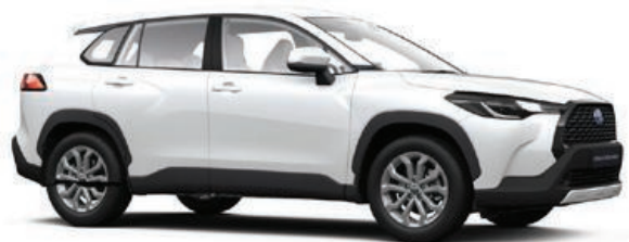
Pearl Ice White (089) Pearlescent