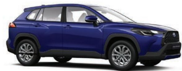
Cobalt Blue (8W7)