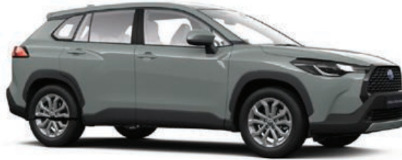
Urban Khaki (6X3)