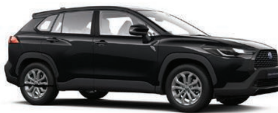
Attitude Black (218)